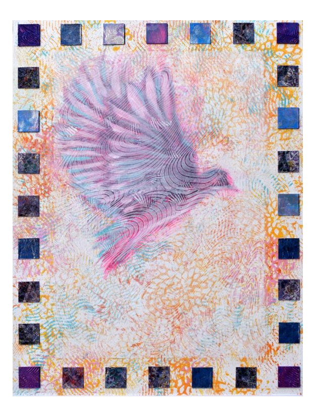
"Up in the Air" by Sally Davies On Display: October 1 – November 30 Greenbelt Arts Center

We congratulate Sally Davies on her latest solo show Up in the Air on display October 1 - November 30 at the Greenbelt Arts Center (123 Centerway, Greenbelt, MD.)