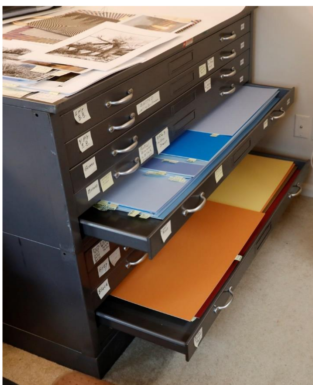
Howard Clark will be moving out of the area in a few months and is hoping to find an individual or an organization that would be