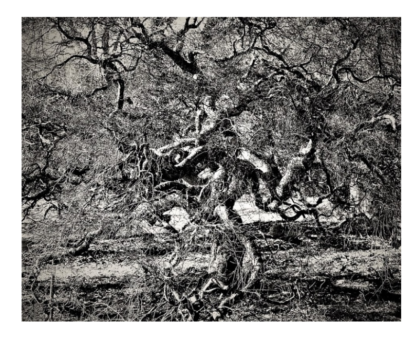
Michael Kuchinsky has two pieces in the 2021 Cumberland Valley Photographers Exhibition on display Jan. 31- April 4, 2021.

the 14x11 acrylic mixed media original. You can view the complete exhibit on line at: <a href="https://www.wheatonartsparade.org/westfield-retrospective">https://www.wheatonartsparade.org/westfield-retrospective</a>