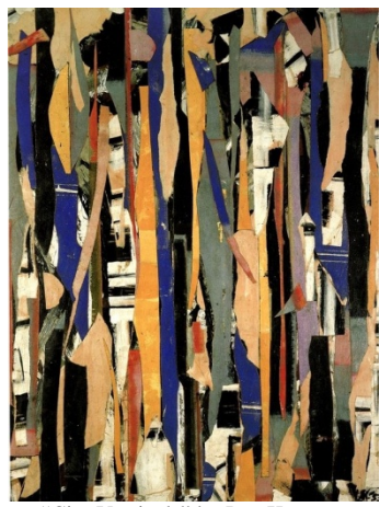
"City Verticals" by Lee Krasner

Frankly, I don't especially appreciate the abstract expressionism these women helped make famous. Abstract art is different from the art I grew up with and it requires skills that I don't believe I possess, yet. It is new and different for me and a bit frightening. But I certainly appreciate the women described in this book.