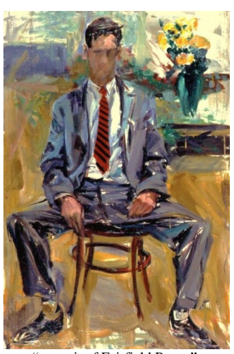
"portrait of Fairfield Porter" by Elaine de Koonig

While new is something to be envied it comes at a price. New affects the existing and people do not always have the same positive feelings when the words "different" and "change" are used. Change requires openness to the different and, the bigger and more important the change is, the more difficult that change may be to embrace.