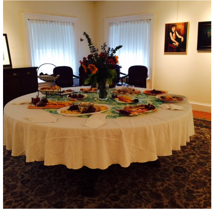
RAL Juried Art Show Reception on May 1, 2016.