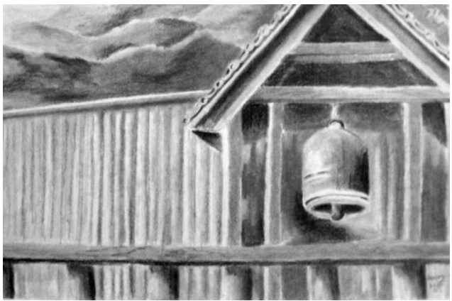
Toll the Shrine Graphite on paper/Penny Kritt

mood. The sketches can be small and just concentrate on the major shapes. It's not a detailed drawing, but a quick way to capture the main idea(s) you want to tell the viewer about.