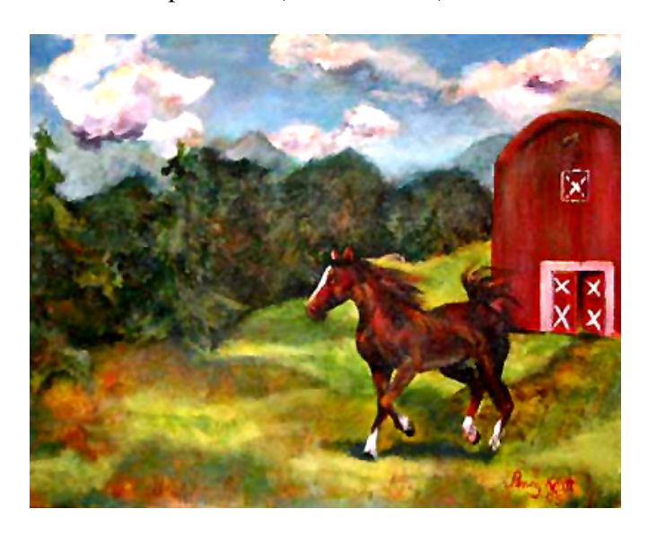
Rush Hour in the Blue Ridge Acrylic/Penny Kritt

My goal was to give the viewer a sense of excitement and anticipation. That meant I had to include the sky and some lawn to show time and weather conditions. There had to be some mountains and trees to describe the place. The barn had to be there to explain that this wasn't some wild mustang roaming the plains. That automatically meant that the horse was a relatively small portion of the overall picture space! It also meant I had to use a landscape format (wider than tall).