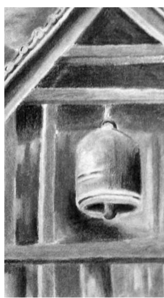
Toll the Shrine (close up) Graphite on paper/Penny Kritt

In the version below, using a tall format instead of a wide one literally becomes a portrait of the bell. Now, all the explanatory information in the version above is unnecessary.