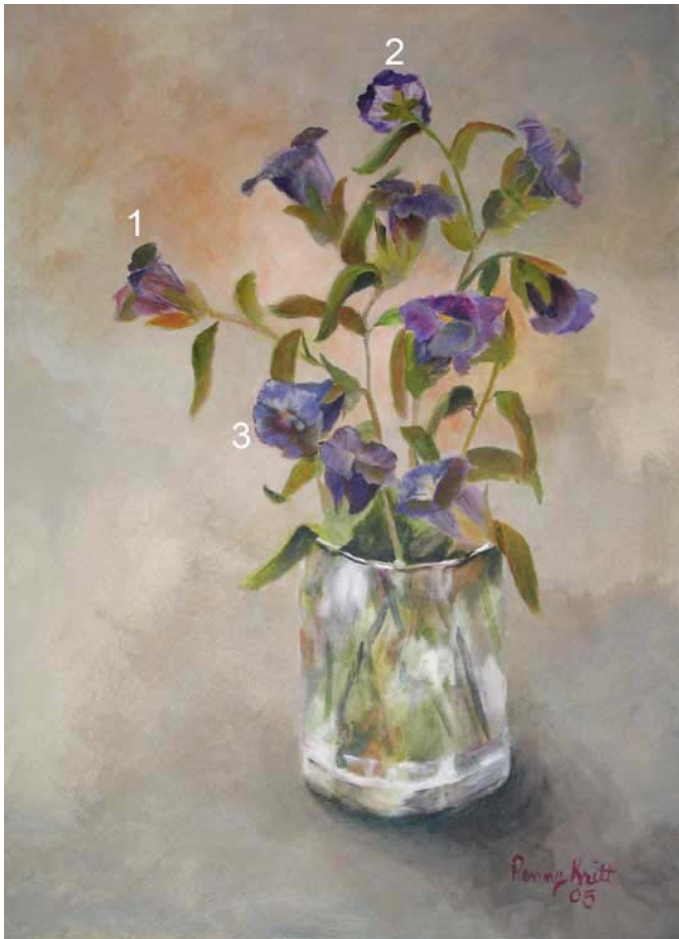
Campanulas in Gray By Penny Kritt

In the painting below, the floral arrangement is painted so you see the side (1), the back (2) and inside (3) of a campanula. It would be boring if all the flowers were painted from the same angle. Think outside the box!