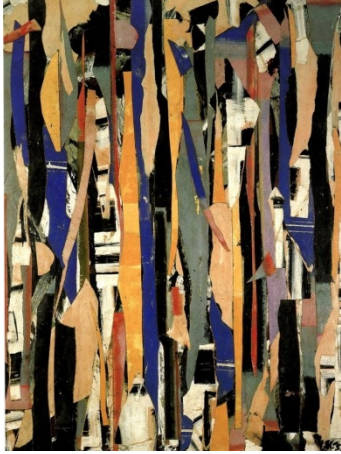
"City Verticals" by Lee Krasner

Frankly, I don't especially appreciate the abstract expressionism these women helped make famous. Abstract art is different from the art I grew up with and it requires skills that I don't believe I possess, yet. It is new and different for me and a bit frightening. But I certainly appreciate the women described in this book.