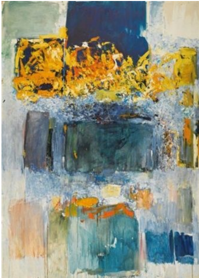
"La Ligne de la rupture" by Joan Mitchell

Their courage, commitment and the risks they took to be different is inspiring. And the more I learn about them and their genre, the more I can like their work. I'm not yet there and may never be but I can feel a change coming (for me) and it feels great.