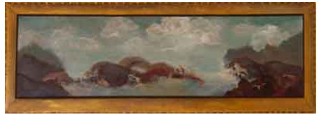
Safe Harbor by Penny Kritt/Acrylic on canvas

I use gallery canvas for the option that I call an optical delusion , also known as trompe l'oeil .