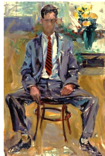
“portrait of Fairfield Porter” by Elaine de Koonig

While new is something to be envied it comes at a price. New affects the existing and people do not always have the same positive feelings when the words “different” and “change” are used. Change requires openness to the different and, the bigger and more important the change is, the more difficult that change may be to embrace.