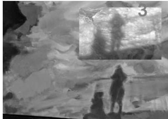
Inset 3 (black and white)

even softer as seen in the photo. That's part of why the figures in the painting look like people standing up (vertical) versus shadows cast on a horizontal surface.