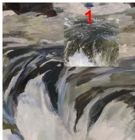
Inset Detail 1