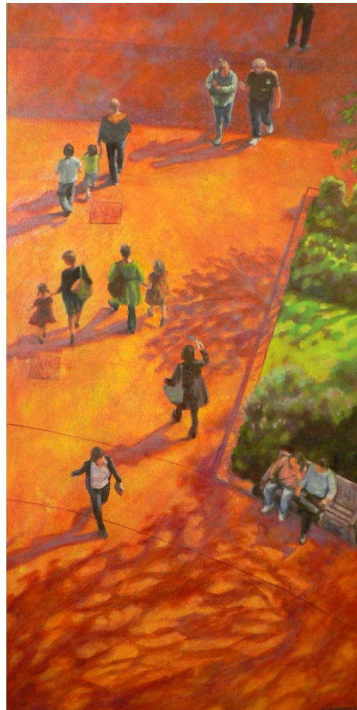
"Are We There Yet?"