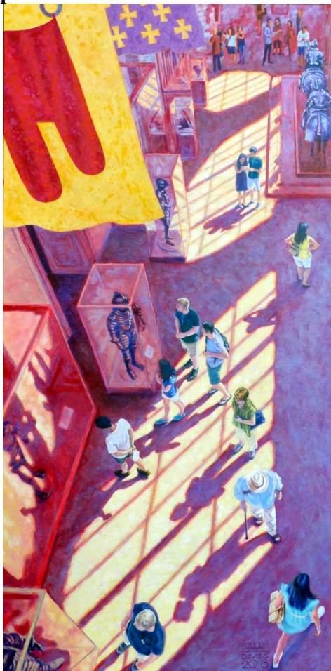
“Time Travel: Armor Room, MET, NYC”