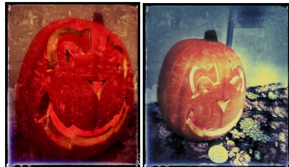
Two versions of a pumpkin photo

Next month, on December 6, Rockville Art League member and multiple award-winning