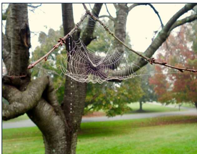
“Spider’s Hammock,”