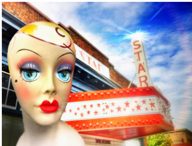
"Fabulous,"

To prepare for the class please download and install the editing app Snapseed BEFORE coming to the meeting. It's a free app made by Google and is considered many mobile photographers the one best photography app to have on a mobile device. Download from the app store for your device's operating system. Snapseed is available for both Apple and Android devices.