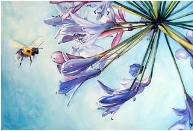
‘Agapanthus & Bee’